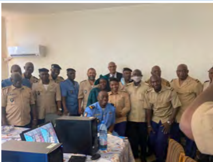
Customs office of Sikasso