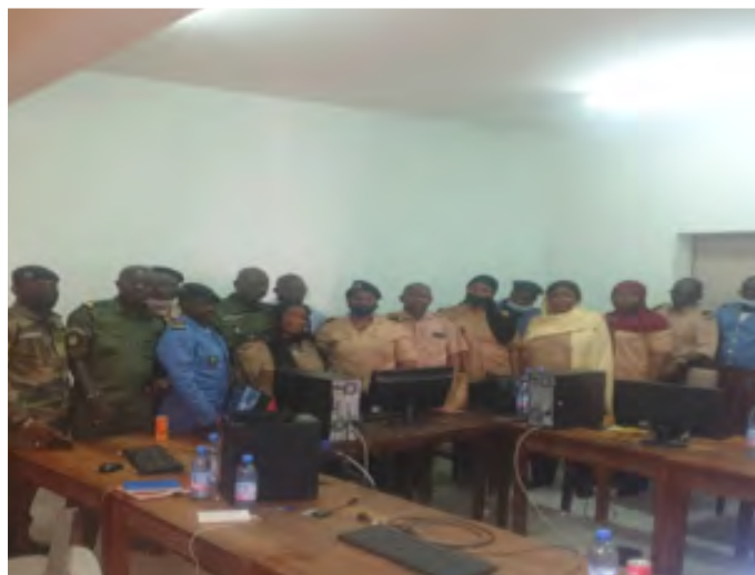
Customs office of Kayes