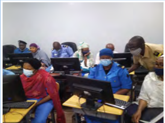
Customs office of Bamako/ Faladié

Training on the Interconnected System for the Management of Goods in Transit (SIGMAT) was held for 145 customs officers and about 50 freight forwarders in Mali. The training began on March 29 and ended on April 10, lasting two weeks and taking place on two TFWA Program corridors—Dakar-Bamako (Kati-Kayes-Diboli) and Abidjan-Bamako (Bamako/Faladié- Sikasso-Zégoua).