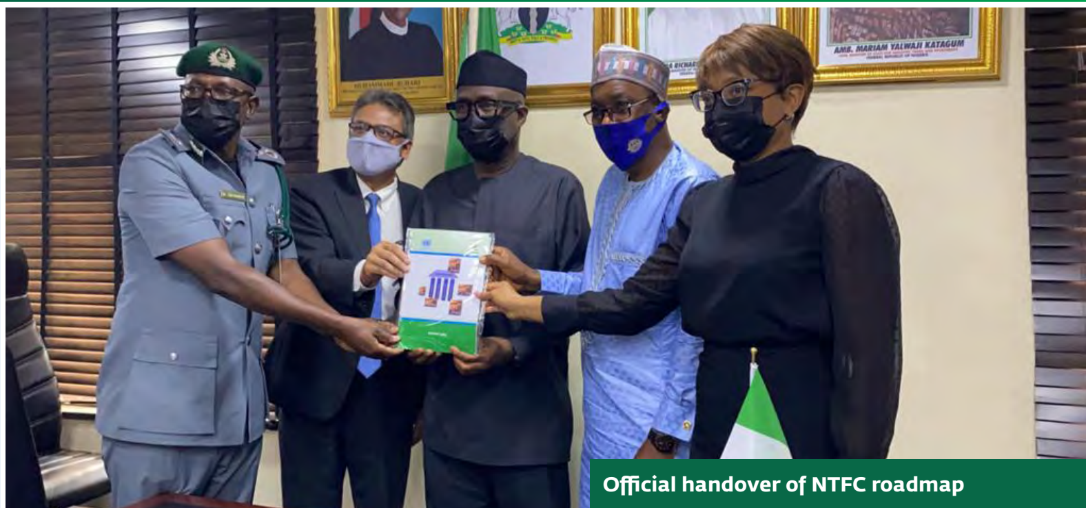
Official handover of NTFC roadmap