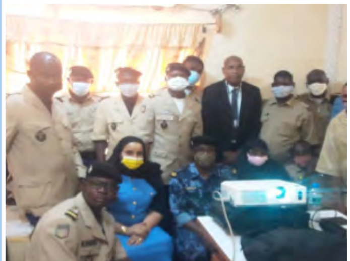
Customs office of Kayes